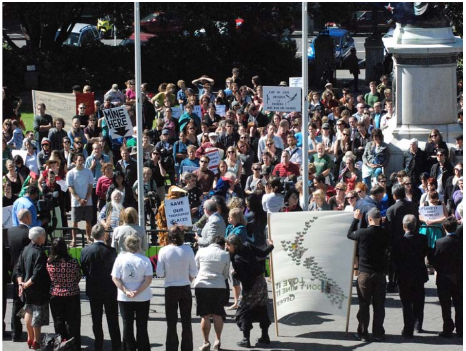
In March hundreds gathered outside Parliament to protest Government plans to allow mining in Schedule 4 Protected Conservation Lands

In announcing the back-down, the government claimed that it now has a mandate to expand mining activity in the rest of the public conservation estate (not covered by Schedule 4) and make it easier for this to happen. However, it is clear that there is no such mandate, and Forest & Bird will be campaigning hard to ensure that the rules for mining in the public conservation estate are tightened rather than loosened.