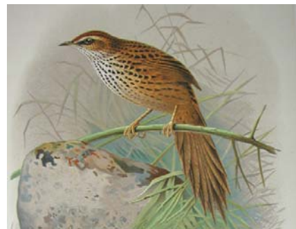
The fernbird, about 18 cm in length

From Kaitaia to Stewart Island, every Forest & Bird branch surely has threatened wetlands or low scrublands in its area, meaning every branch likely has fernbirds dwelling on its patch. Vote the fernbird for "Bird of the Year" so we can honour this distinctive endemic species, attract more attention to wetland restoration, and save the threatened fernbird's habitat before it's too late! [See Pollen Island, pg. 7]