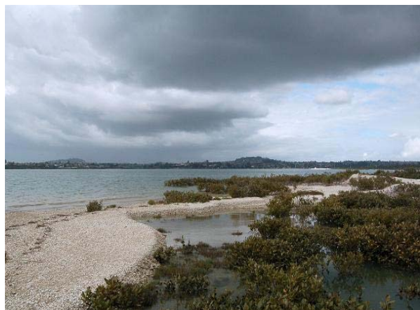
Pollen Island: perfect fernbird habitat [See pg. 3.]

As another step in this strategy, we have nominated the fernbird for Forest and Bird's Bird of the Year competition [see pg. 3] because fernbird live on Pollen Island and can be considered an iconic bird symbolizing the need to further protect this wetland area. We ask that members seriously consider going to www.forestandbird.org.nz and voting for fernbird to show their support for this local branch campaign.