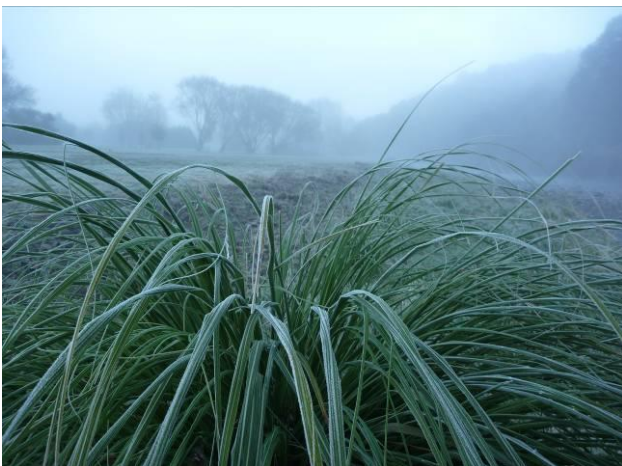
Frosty morning, Hutt River