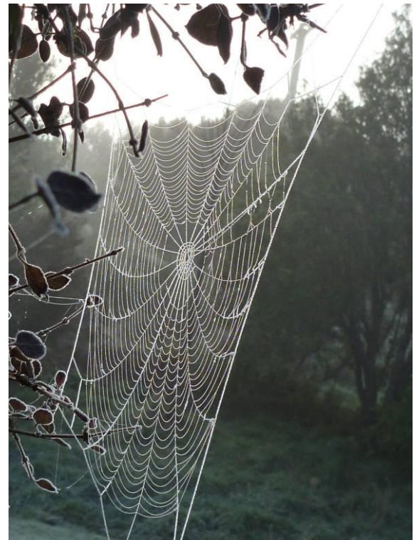
Frosted spider web, Hutt River