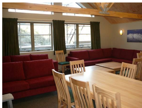
Dining & Lounge

We encourage you to book a weekend or several nights away to enjoy the new lodge - you won't regret it. We have to finish paying for it now so, if you like what you see, I encourage you to dip into your pocket and help us clear the $200,000 left to clear the debt.