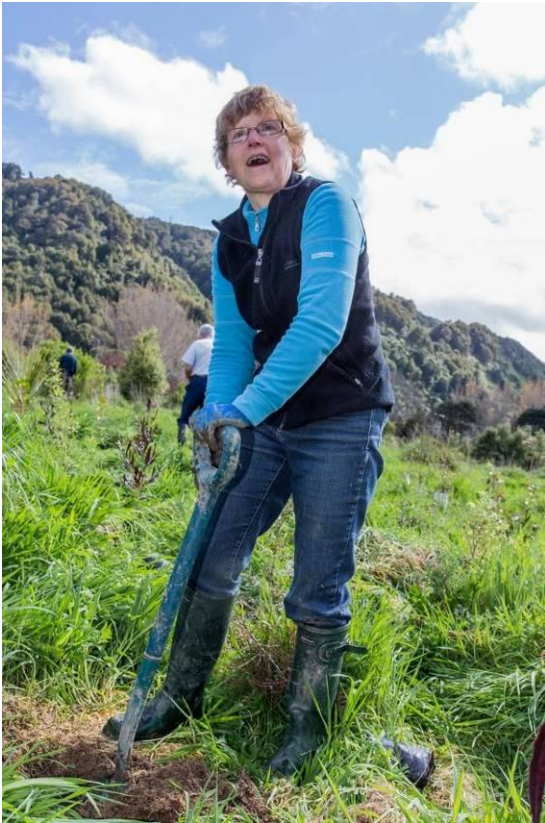
If you're happy and you know it, dig a hole!!