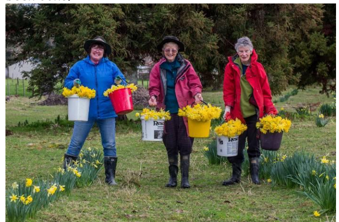
3 little girls are we...

The weedspraying along the River Trail has now been done.