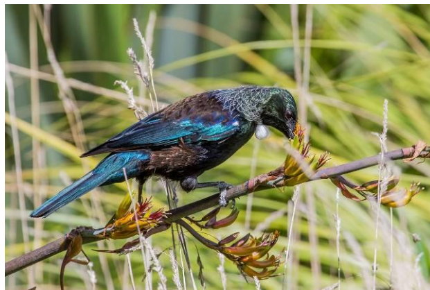
If only if we could imbibe of the nectar of youth...

Thank you again to our Mayor and Councillors, council staff as well. We appreciate your support very much.