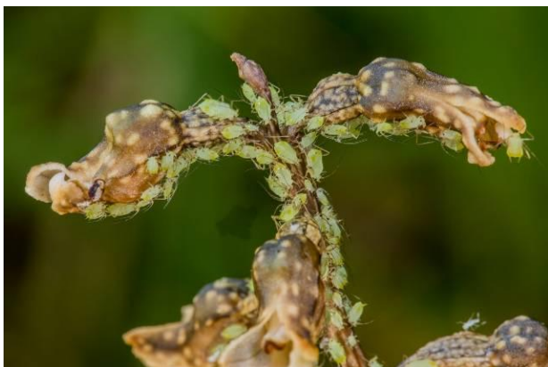
Milking time! (Gastrodia orchid and 'friends') Do you have this orchid in your garden?

For those who don't know the Shade House is situated at the North end of Maidstone Park and is inside the Upper Hutt City Council depot along with the Rural Fire Service and the UH Amateur Radio Club. The facilities we use are remaining from the days when Council had its own nursery and staff looking after its Parks and Reserves. These facilities are the envy of the three other Forest and Bird nurseries in the Wellington Region.