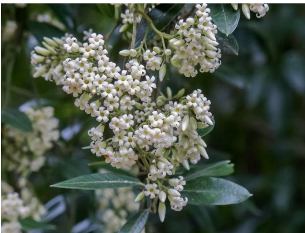
Parsonia flowers.