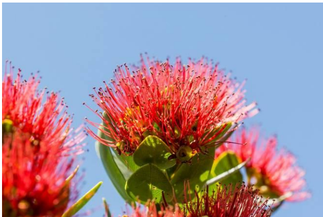
Rata flowers

Discussion: What will we do for the 50 th anniversary for Upper Hutt as a city?