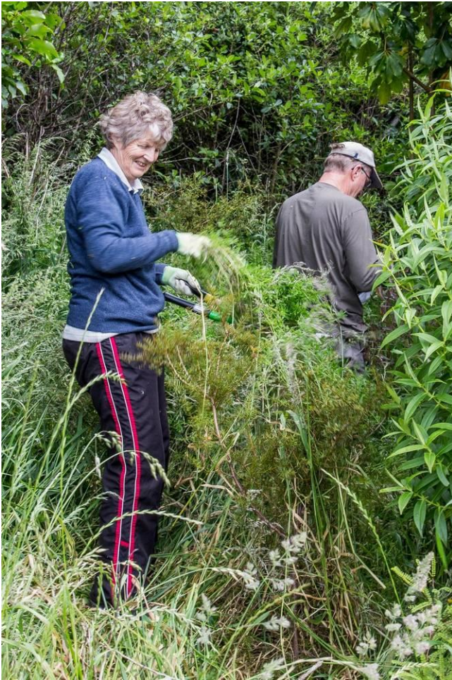
Rescuing a totara from the strangling grass and blackberry along the River Trail by the weir. Photo - Allan Sheppard.