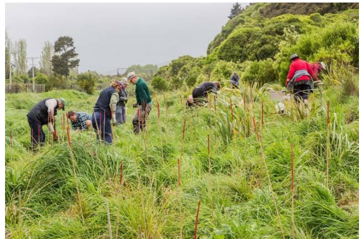
Hull's Creek Triangle