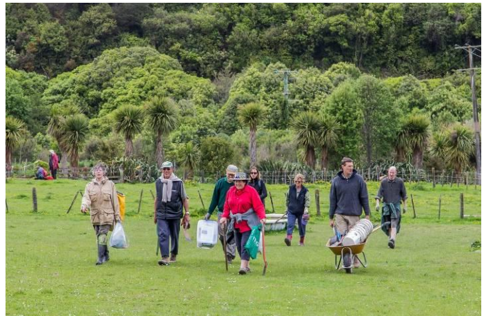
A satisfying evening's releasing