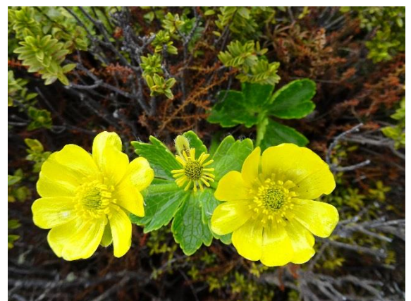
Alpine flowers at Tama Lakes