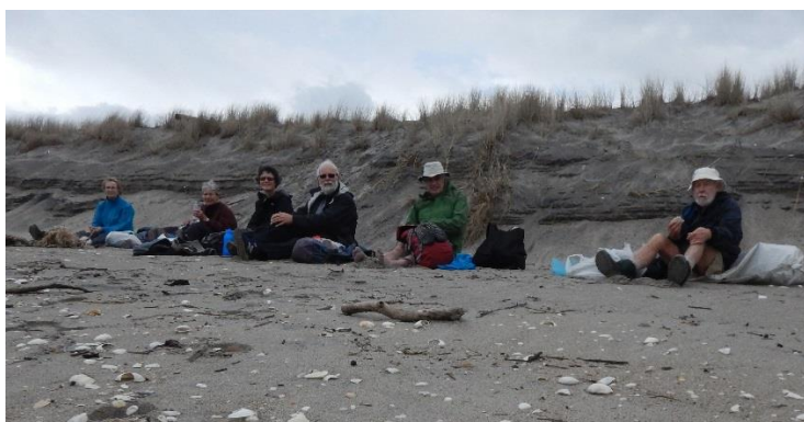
Lunch at the Maketu Sandspit

After morning tea we set off back along the ocean beach doing a beach tidy as we went. We collected quite a lot of rubbish; mainly plastic bottles and aluminium cans but also a variety of other items, including a large tangled mess of fishing line. It was good to get that off the beach as it is a real menace to bird life.