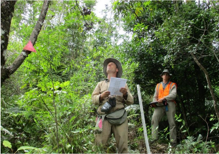
Counting mistletoe plants in Tikitapu Scenic Reserve

This work has shown that pest control has a significant effect on the survival and spread of mistletoe plants compared to areas with no animal pest control. While it was disappointing to see a lot of storm damage to both mistletoe and host plants from the high winds in early January 2018, there is still abundant recruitment of new hosts and mistletoe plants. The high turnover of host trees, such as five finger, Pseudopanax arboreus , was very noticeable in some areas. However, there are significant numbers of new young five finger plants coming through and a lot of bigger existing five finger trees, with very few or no mistletoe plants on them yet.