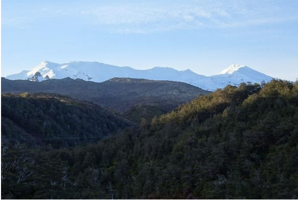
Sunrise on Ruapehu from the Lodge

The Forest and Bird Lodge at Ruapehu sits nestled in beech forest at the end of Rahui St at Whakapapa Village. Rahui St follows the path of the Whakapapanui Stream where you can sometimes hear the high pitched 'song' of the whio, blue duck. Fifteen people spent a wonderful weekend in the comfortable lodge. Saturday morning dawned with the top of Ruapehu cloudless and gave plenty of options things to do; everyone was free to select the walks or activities that suited them. Silica Rapids and Taranaki Falls were among the most popular, with three people heading for Hauugatahi, the smaller peak that is visibly from Whakapapa. Back at the lodge we shared experiences of what had happened during the day over a lively pot-luck Saturday night dinner. We commend Sue van Dorsser's organisational skills in getting 15 people around one table.