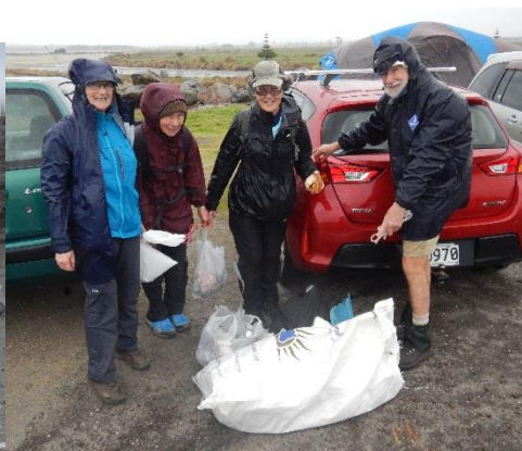
Back at the cars with the rubbish