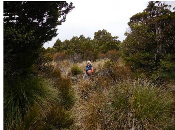
At the tarn on Hauhungatahi