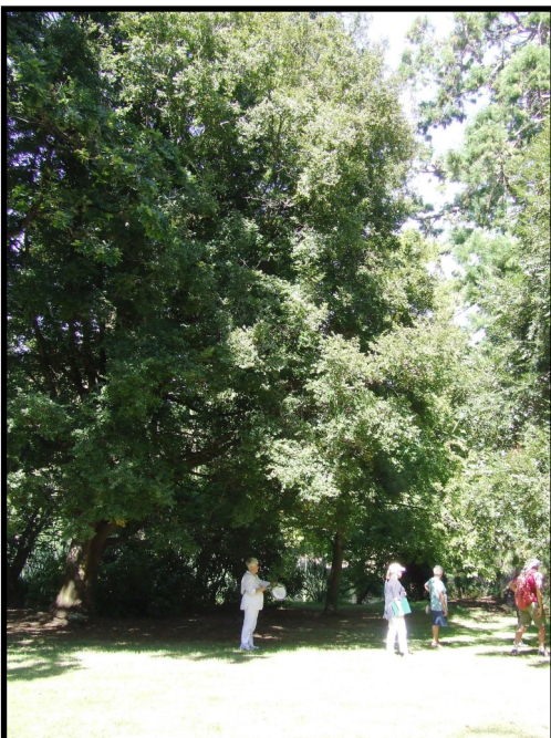
Mature Red Beech ( Fuscospora fusca , formerly Nothofagus ) on the left, near the aviary.

There are still a number of trees that by their size alone could have come from the original plantings but a greater number would have been lost through storms, weather, neglect or design changes. However, all the following Superintendents would have made their mark on the gardens by planting replacement and new trees and shrubs. The result is a fabulous collection of trees from Europe, Asia, the Americas and Australasia that provide something of interest all year round. Council has recently been doing a good job at labelling the trees, with more to come. This makes identification much easier and we urge you to have a wander. You will be pleasantly surprised!