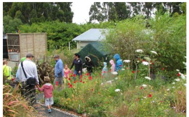
KCC outing at Earthlore Insect Theme Park