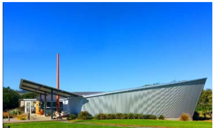
Owaka Museum & Catlins Information Centre

earthlore@ihug.co.nz www.earthlore.co.nz