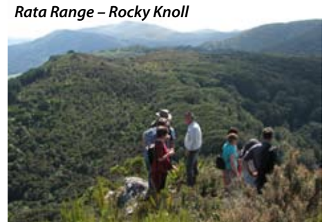
Rata Range – Rocky Knoll