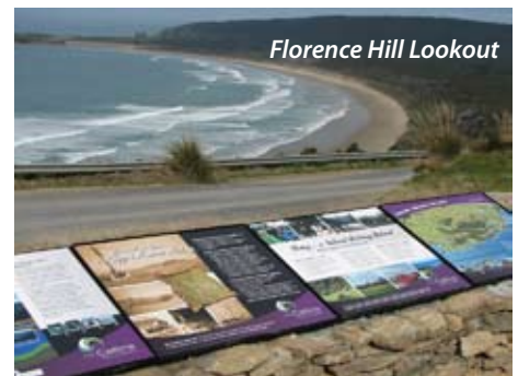
Florence Hill Lookout