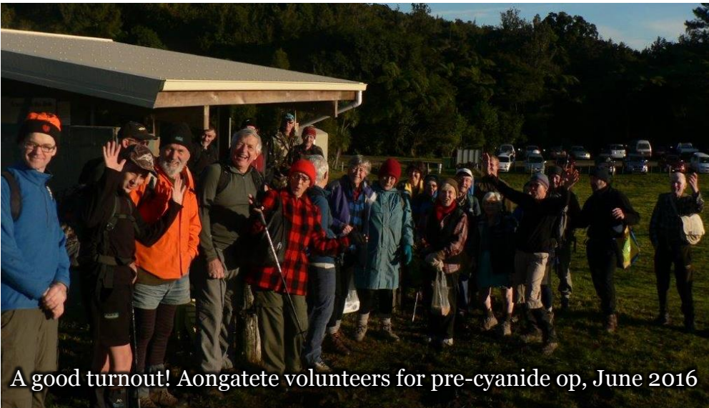
A good turnout! Aongatete volunteers for pre-cyanide op, June 2016

And turning to plants, we recently found something new - a grove of king ferns in a deep gully. These mighty ferns should be common but deer and pigs have eaten them out of most of the Kaimais. If you haven't seen a king fern before there are a number of fine, big plants in the gardens of the Elms.