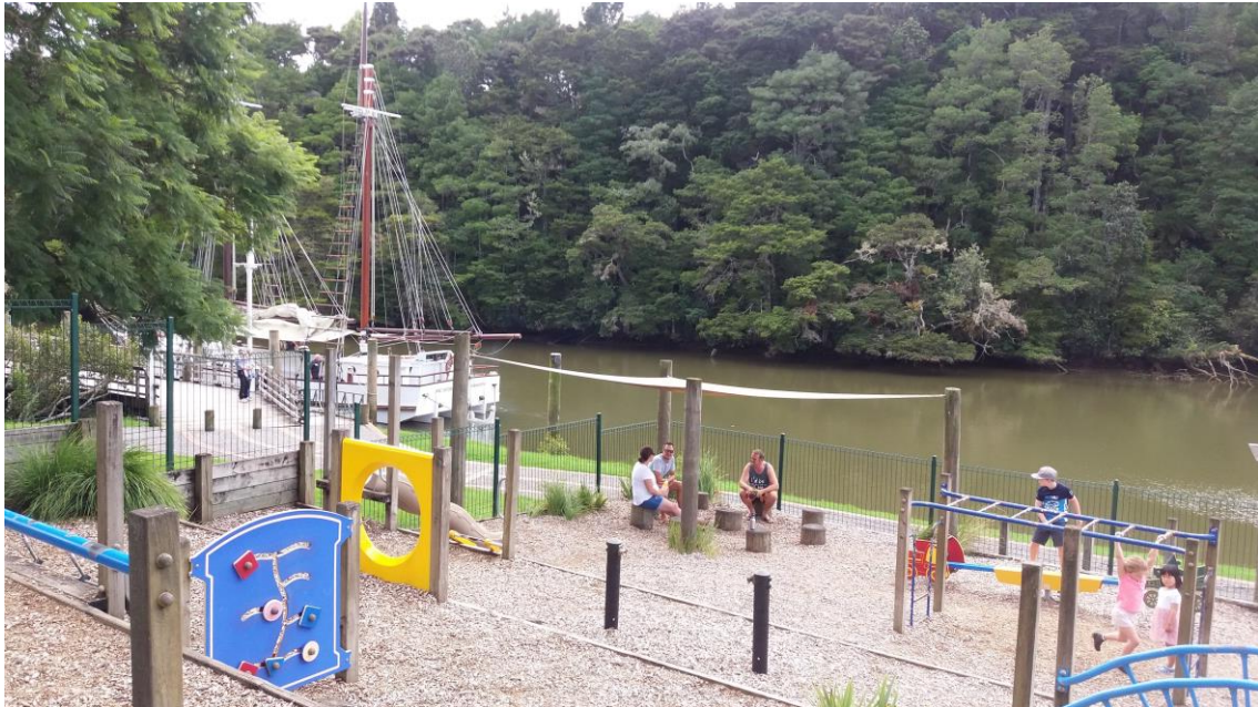
Getting the children