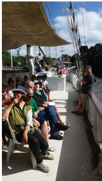
and everyone else engaged with Nature KCC Trip on Jane Gifford 08/04/2018