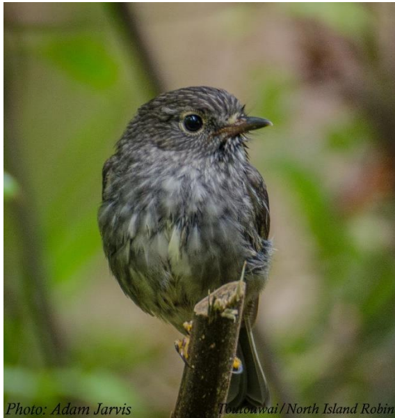
Tūtohiwai / North Island Robin