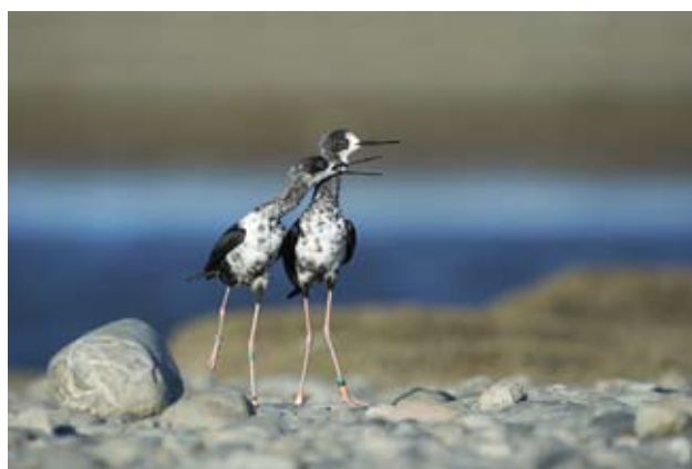
Juvenile kaki (black stilt) Craig McKenzie

South Otago Forest & Bird presents the 2nd edition of: