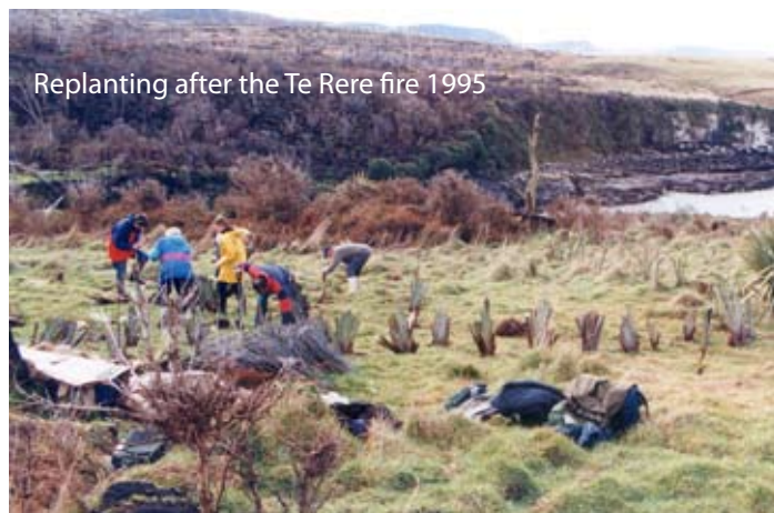
Replanting after the Te Rere fire 1995

The very first branch outing that Buddy and I had with Forest & Bird was to Waituna Lagoon in Southland, a very interesting place with its wealth of bird life. There were many more outings such as an overnight one at Arrowtown where we were taken to Macetown on Buddy's trailer pulled by his International Cub Tractor. [But did they have a health & safety plan? ed]