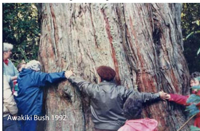
Awakiki Bush 1992