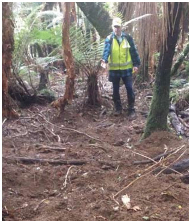
Pig damage at Forest & Bird's Lenz Reserve

https://ngaherejustice.wixsite.com/letter/english