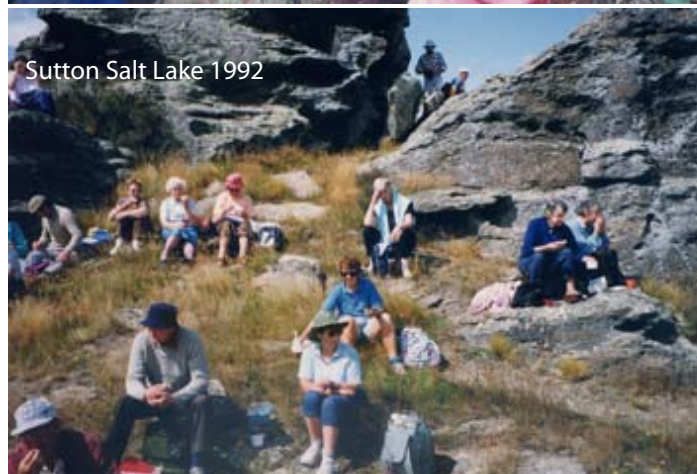
Sutton Salt Lake 1992