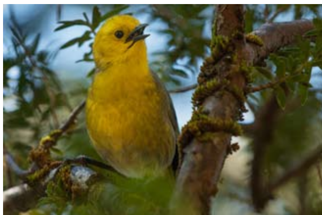
The use of 1080 has been important for the protection of South Island mohua/yellowhead populations

Death threats, threats of violence, incitement of violence, acts of violence and acts of vehicle sabotage have all been carried out against DOC staff and iwi/hapū kaitieki and this is absolutely unacceptable. No Department of Conservation worker, helicopter pilot,