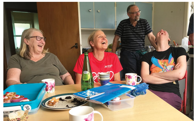
Must have been the one about the weevil and the aciphylla squarrosa .