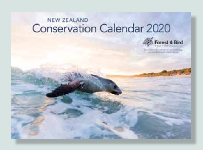
Recommended Retail Price $17.99

Featuring superb photographs of our extraordinary wildlife and wilderness habitats taken by some of our leading nature photographers.