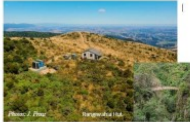
Rangiwahia Hut

Bring your tramping boots and come along for a scenic walk up the Rangiwahia Track. We will encounter native birds, majestic trees, views of Mt Ruapehu and a waterfall on the way. After crossing the beautiful arched bridge over a deep gorge, we eventually reach the bush-line and Rangiwahia Hut. This hut with its skiing history is one of the most popular tramping huts in the Ruahine Forest Park. Up here we will explore some alpine plants (if not covered in snow!) and hopefully enjoy the amazing views of the Central Plateau and even Mt Taranaki. After lunch we will return to the carpark the same way.