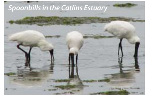
Spoonbills in the Catlins Estuary

Easily accessible waterfall, 18 km south of Owaka, located on the Matai stream in the Catlins Forest Park.