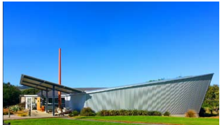
Owaka Museum & Catlins Information Centre

129 Hinahina Road, Owaka 03 415 8455 027 385 3182 earthlore3@gmail.com www.earthlore.co.nz