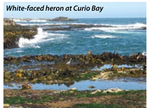
White-faced heron at Curio Bay