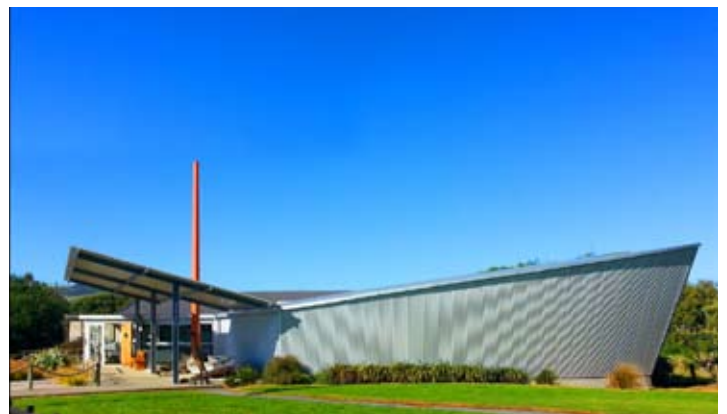
Owaka Museum & Catlins Information Centre

129 Hinahina Road, Owaka 03 415 8455 027 385 3182 earthlore3@gmail.com www.earthlore.co.nz