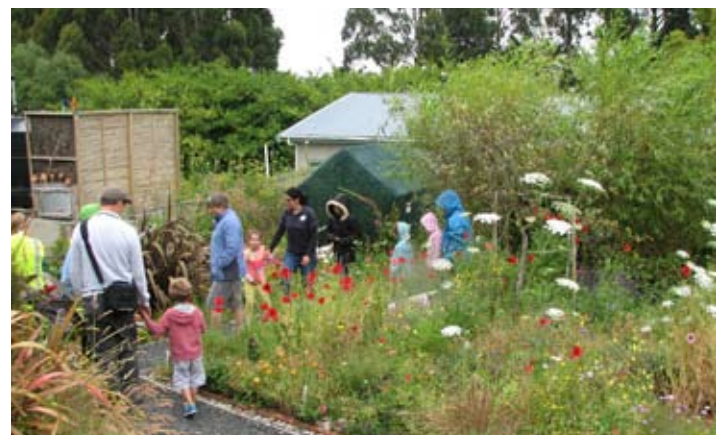
KCC outing at Earthlore Wildlife Gardens