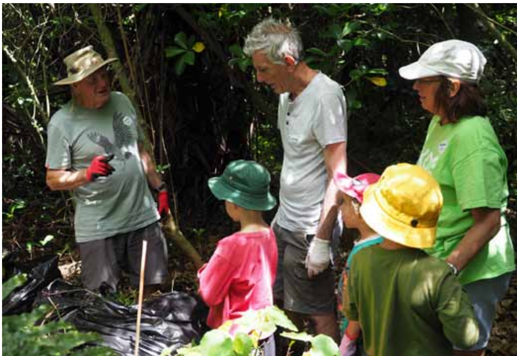
That's us on the day of the Great Tradescantia Pursuit. We gathered 23 black bags full!