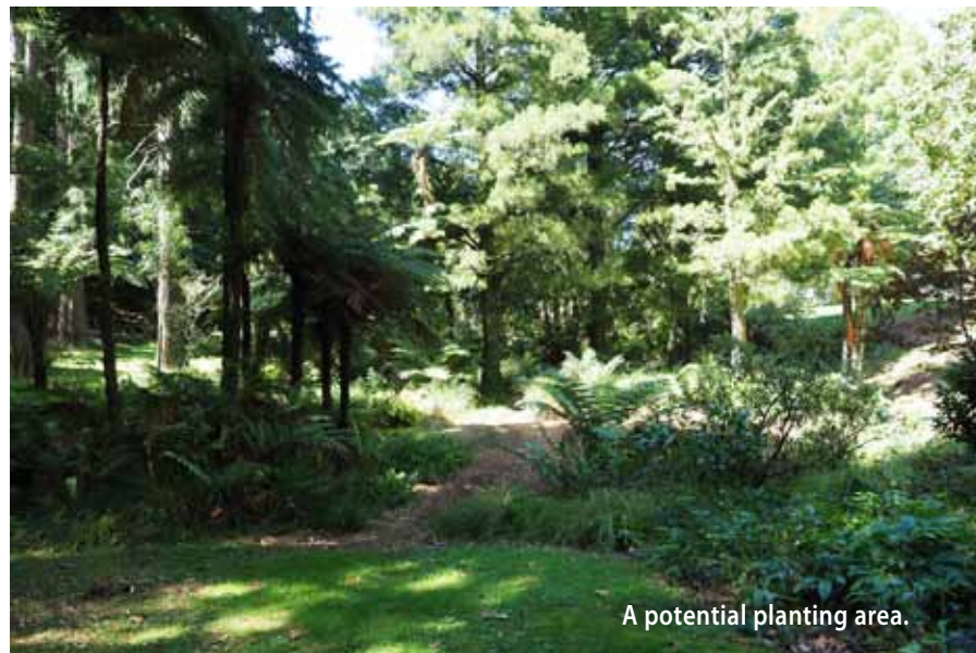
A potential planting area.

“We have robbed the birds of tremendous areas of bush on the mainland. Are we not patriotic enough to give them a last secure resting place on this small island, seven miles by one mile in area, in order that our children and children's children may see and learn what New Zealand was really like when their daring forefathers first set foot in this land of ours?” — Captain Sanderson, 1922.