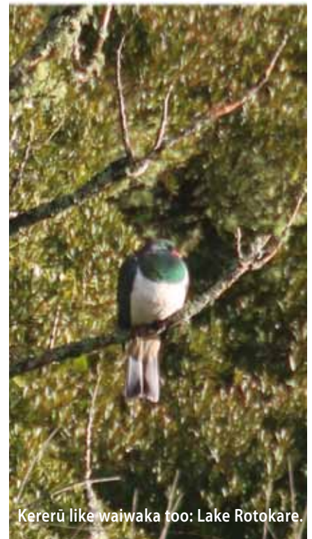
Korerū like waiwaka too: Lake Rotokare.

“We have robbed the birds of tremendous areas of bush on the mainland. Are we not patriotic enough to give them a last secure resting place on this small island, seven miles by one mile in area, in order that our children and children's children may see and learn what New Zealand was really like when their daring forefathers first set foot in this land of ours?” — Captain Sanderson, 1922.