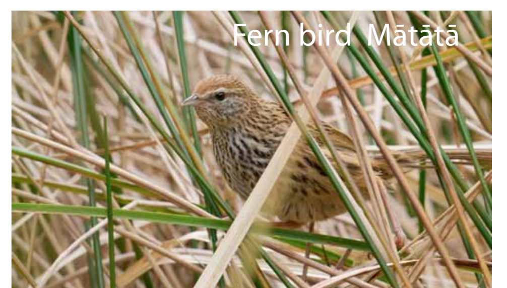
Fern bird Matata