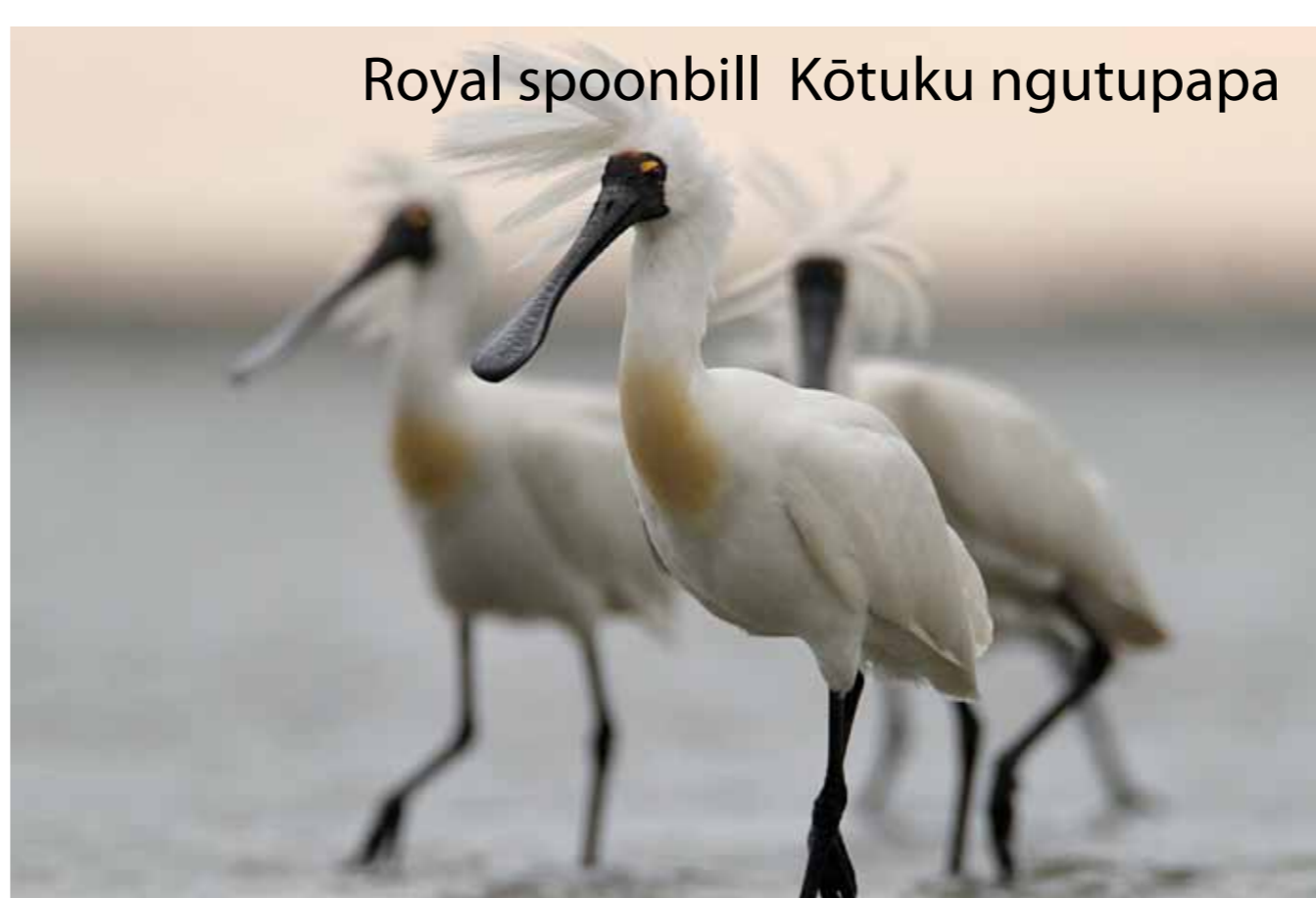
Royal spoonbill Kotuku ngutupapa