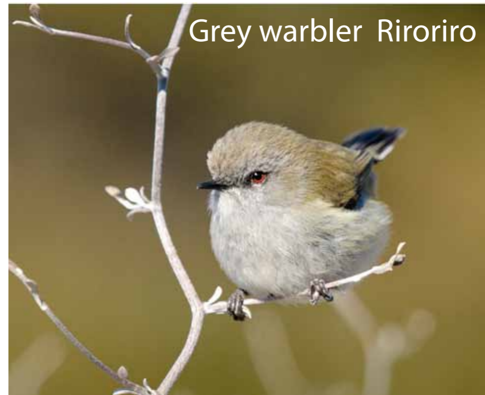
Grey warbler Riroriro