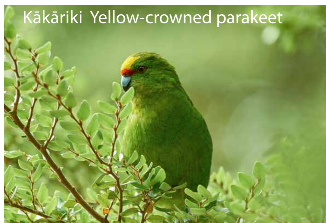
Kaakariki Yellow-crowned parakeet