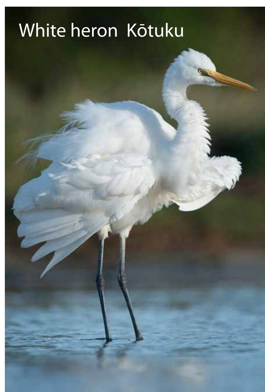
White heron Kotuku