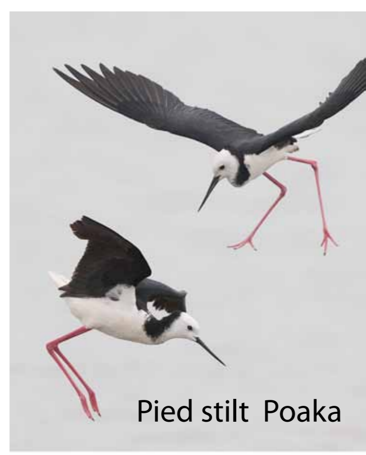
Pied stilt Poaka