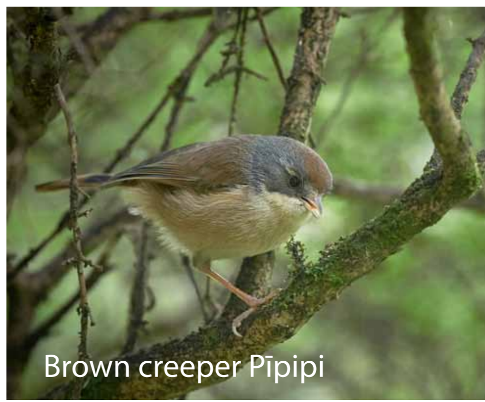
Brown creeper Pipipi