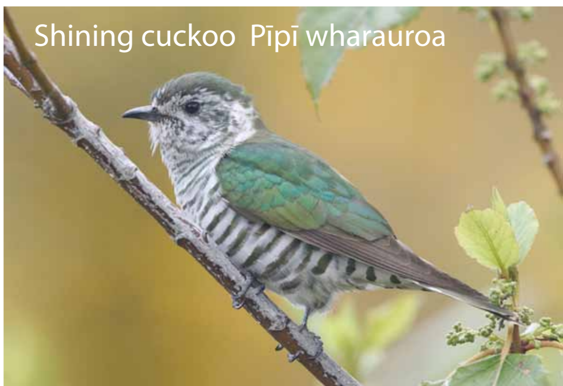
Shining cuckoo Pipi wharauoa