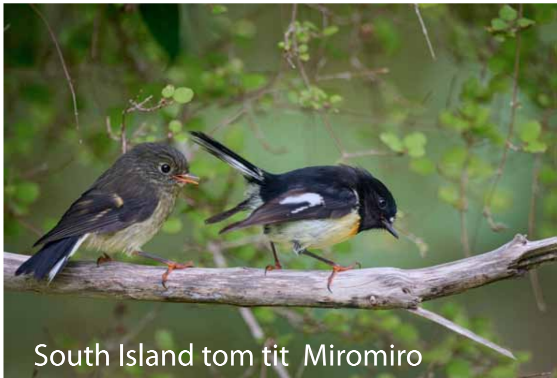
South Island tom tit Miromiro