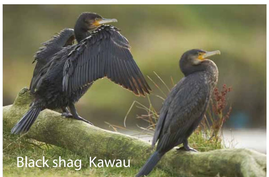
Black shag Kawau