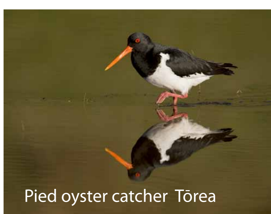
Pied oyster catcher Toreia