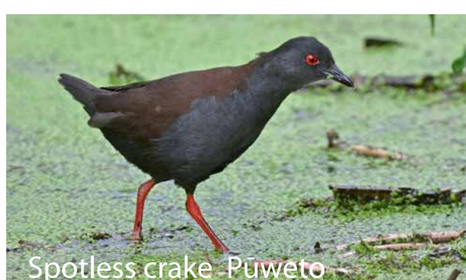
Spotless crane Puweto