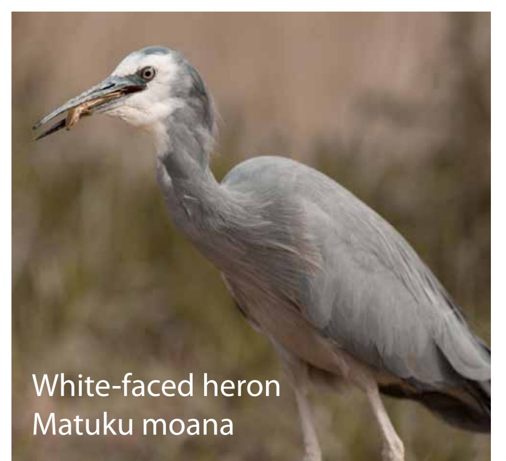
White-faced heron Matuku moana

These species have all been observed at Tautuku in The Catlins, but some of the photographs have been taken in other locations.