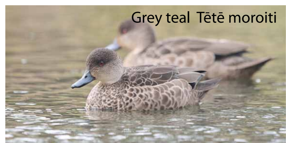
Grey teal Tetemoroiti