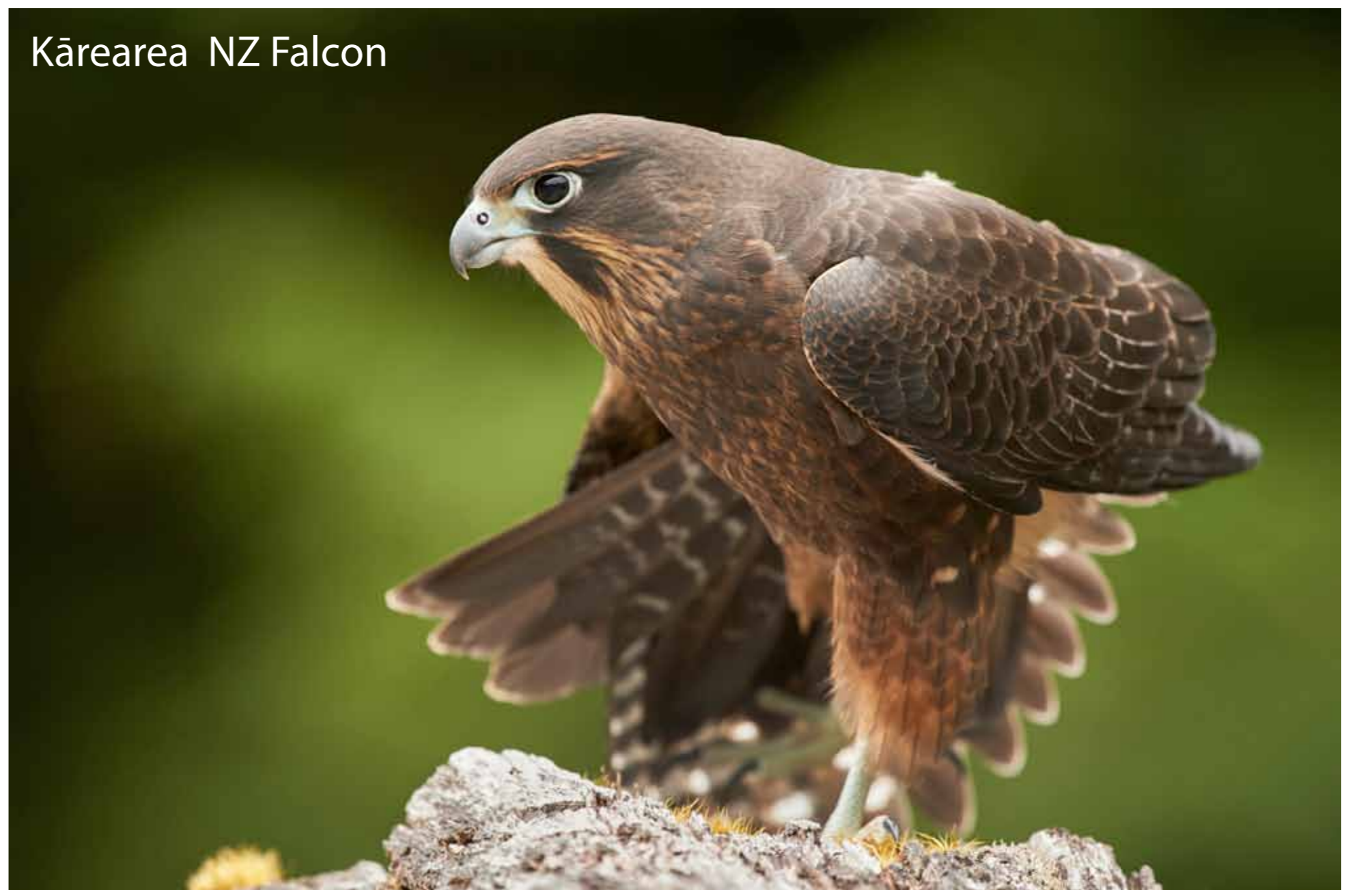
Kaerearea NZ Falcon