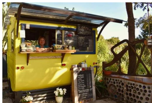
The Little Rocket Coffee, Papatowai