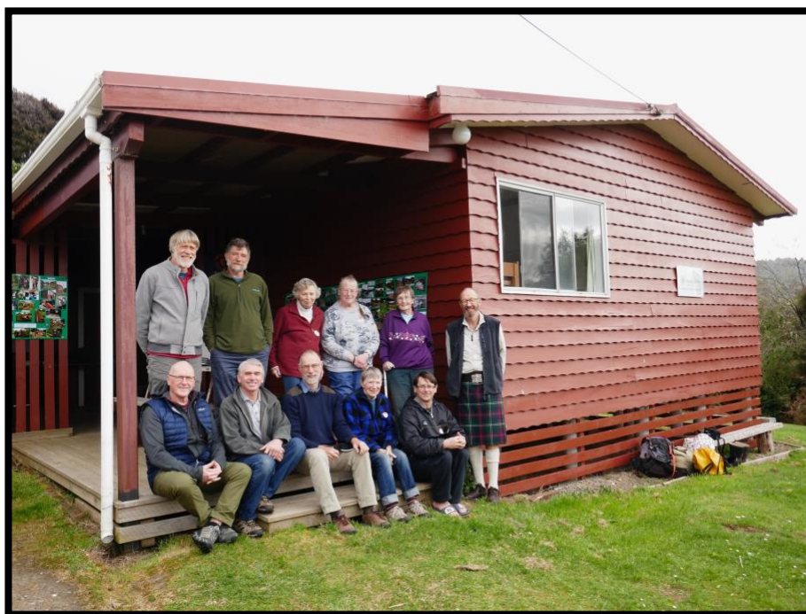
Lenz Reserve management Committee (2019)

Note: Cell phone coverage cannot be guaranteed, One and 2Degrees may work. The nearest public phone is located at the Papatowai shop. There is a landline at Tautuku Education Centre off the main highway to the north of the Reserve, which may be available in emergencies provided that there is someone in residence.