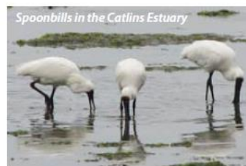
Spoonbills in the Catlins Estuary

Easily accessible waterfall, 18 km south of Owaka, located on the Matai stream in the Catlins Forest Park. Access to the Matai Rail Trail – a 1 hour return walk along the old railway line. Take a picnic to the picnic table at the return point of the walk.