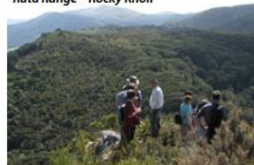
Rata Range – Rocky Knoll