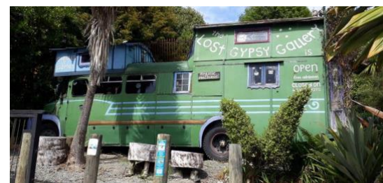
The Lost Gypsy. Gallery, Papatowai