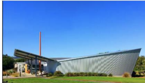
Owaka Museum & Catlins Information Centre

KCC outing at Earthlore Insect Theme Park