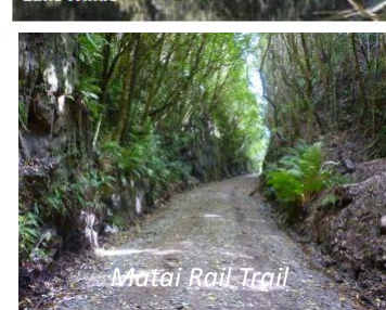
Matai Rail Trail