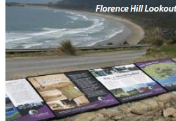
Florence Hill Lookout