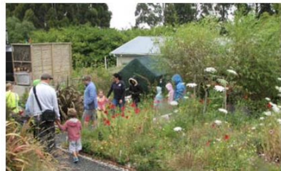
KCC outing at Earthlore Wildlife Gardens