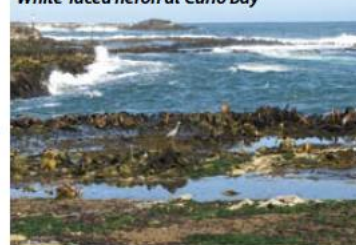
White-faced heron at Curio Bay