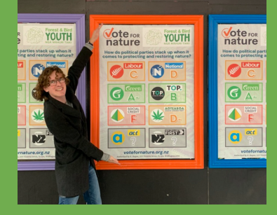
Scorecard for Nature F&BY Campaigns Hub For the 2020 General Elections, the Hub created scorecards that rated the policies of each political party. The scorecards captured attention around the country and caused quite a stir!