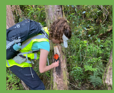
Hoskings Reserve Project F&BY Tāmaki Makaurau Auckland Hub This legacy project belongs to our Auckland members, who fully manage the area's restoration. They've planted over 20,000 plants and are actively monitoring and controlling predator numbers.