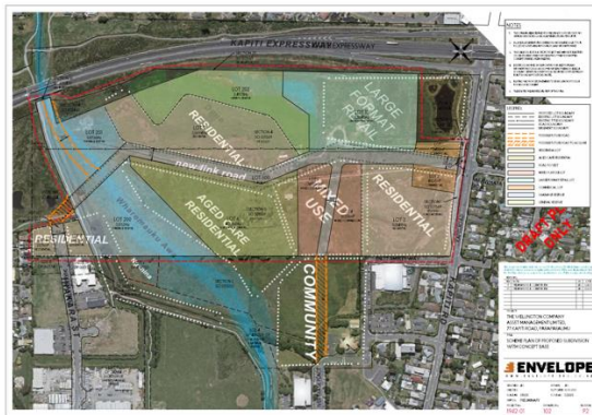
The Wellington Company Development plan

The Wellington Company development will remove some of the peat wetlands, replacing it with sand to build on, thereby halving the peatland capacity and increasing flood risks.