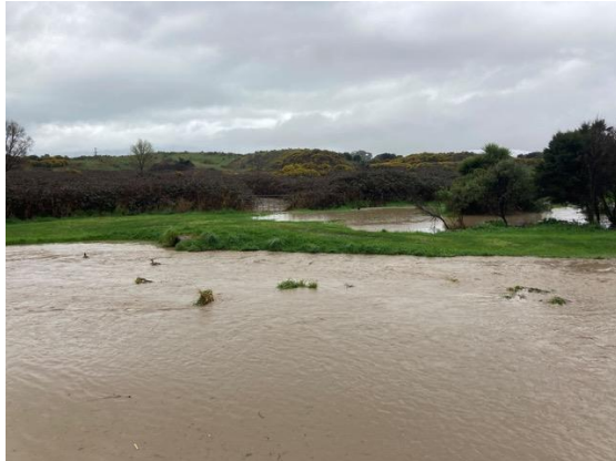
Wharemauku overflowing onto Wellington Company land August 2024

of water during the moderate weather event in August 2024 when the Wharemauku Stream overflowed into it.