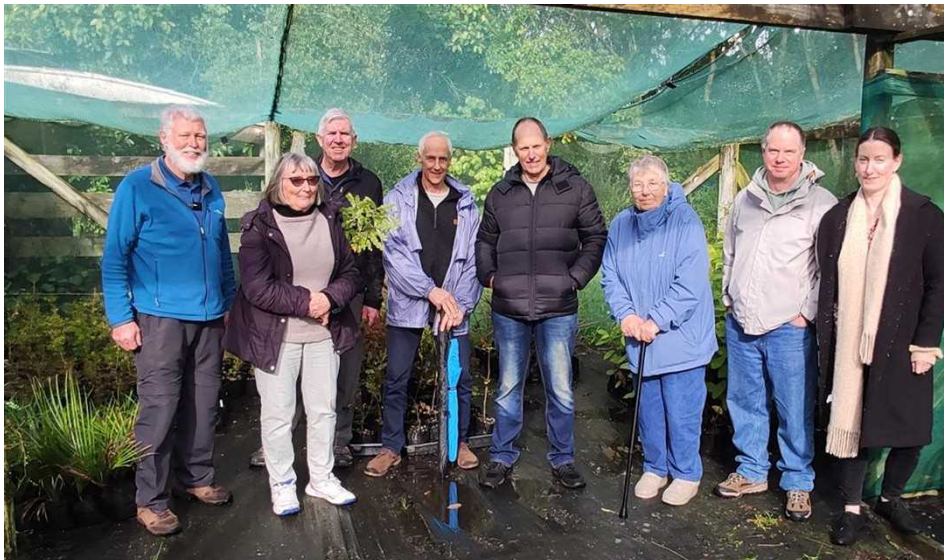
In August the committee had a visit of three branch support people to get us up to speed on some computer things and after lunch we visited the nursery to show them around .