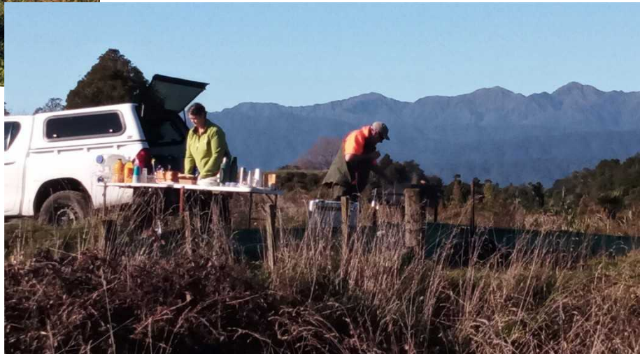
Lunch with a view