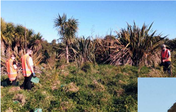
Around 500 plants were planted