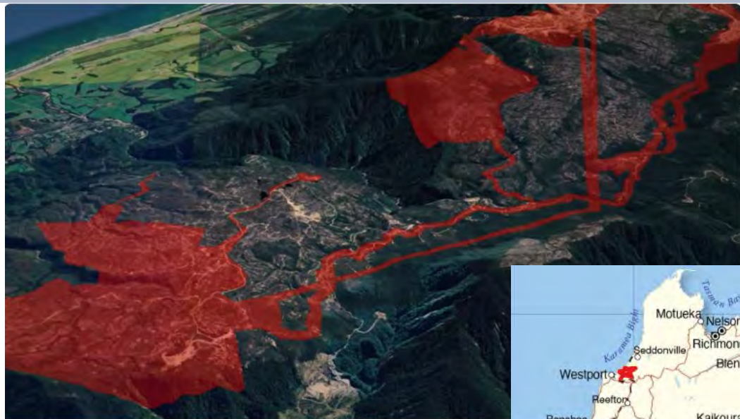
Overlay of Proposed Coal Mine at Denniston Plateau