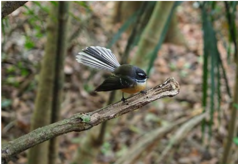
A pīwakawaka fantail at Te Wairoa

A draft pest control checklist and trapping roster is being reviewed, to support new volunteers and ensure consistency. Repairs to fence posts and contractors to support weeding and spraying along the State Highway frontage are being organised.