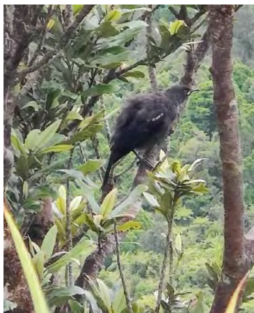
Baby Tui on Kaitake Range

I hope you have all had a relaxing break, ready to look forward to 2026. This young bird is getting ready for a big year, as are other chicks. Please remember to watch out for them, & try & stay below the high tide mark on beaches over summer.