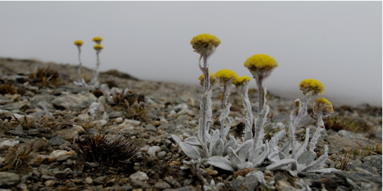
The Pisa Conservation Area , stewardship land acquired through tenure review, is home to distinctive landforms and ecological systems.

Yet whilst a driving factor in the formation of the Park was the protection of unmodified areas of limestone karst, the majority of the significant caves remain outside the National Park boundary in stewardship areas like Charleston.