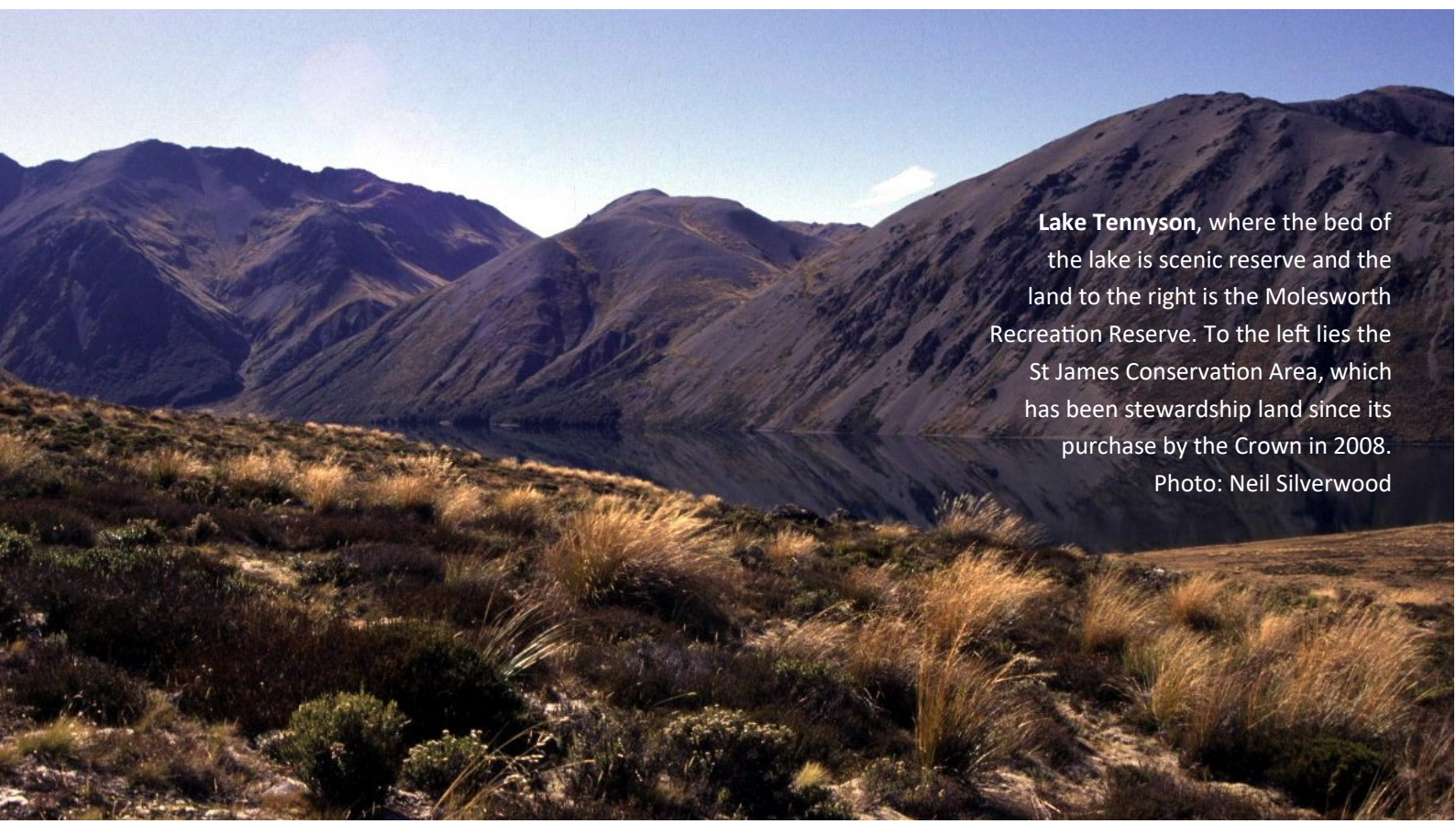
Lake Tennyson , where the bed of the lake is scenic reserve and the land to the right is the Molesworth Recreation Reserve. To the left lies the St James Conservation Area, which has been stewardship land since its purchase by the Crown in 2008.

Tenure review of publicly-owned high country stations has also resulted in additions of approximately 370,000 ha of conservation land. Much of this high country tussock and alpine landscape has been left in stewardship status.